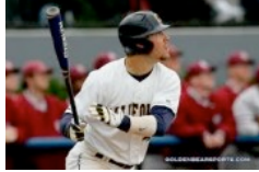
UC Berkeley reinstates three sports teams after cuts